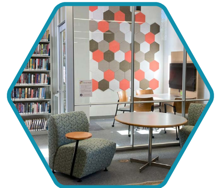
The new study room/ small meeting room