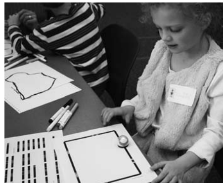
Using our new Ozobots , students of all ages can explore computer coding.

Number of people who visited the Library: 59,985 Total program attendance: 10,495 Attendance of children and teens at Summer Reading events: 2,628 Holdings: 95,844 total (41,248 print, 47,490 digital materials) Circulation: 108,741 grand total (total collection use) Reference questions answered: 18,807