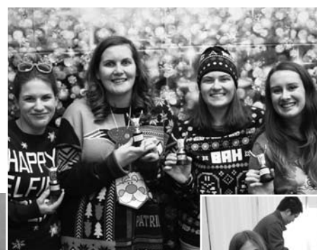
At our first Ugly Sweater Cookie Swap Party, members shared cookies and enjoyed fun activities.