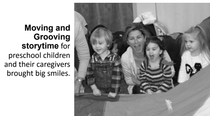
Moving and Grooving storytime for preschool children and their caregivers brought big smiles.